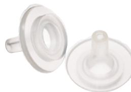
Xtra Clean Conical cap