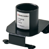
Stand for manual and auto crimper/decapper