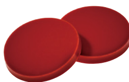
Xtra Low Bleed HS septum

Elution of the bleeding components is low even if the temperature is kept at 300 °C, enabling analysis at high temperatures, which had been difficult with a headspace sampler.