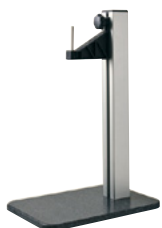
Base for auto crimper/decapper